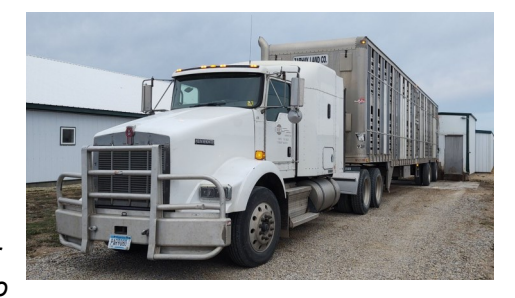
Submitted by: Michael Larson

Submit your photos to the office or website by 12/24/21 for a chance to be next month's feature picture!